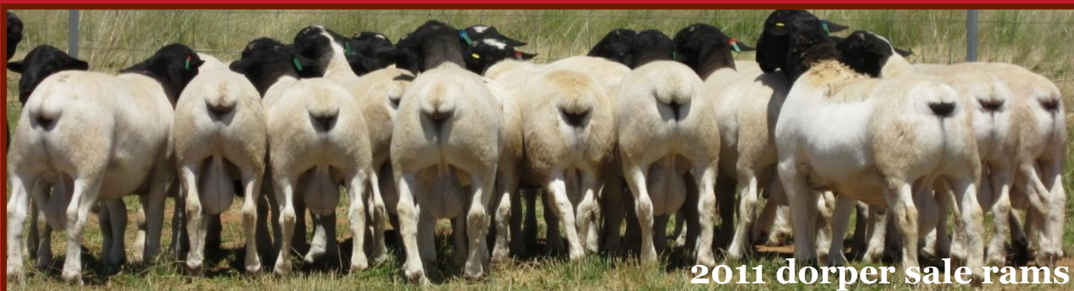
2011 dorper sale rams